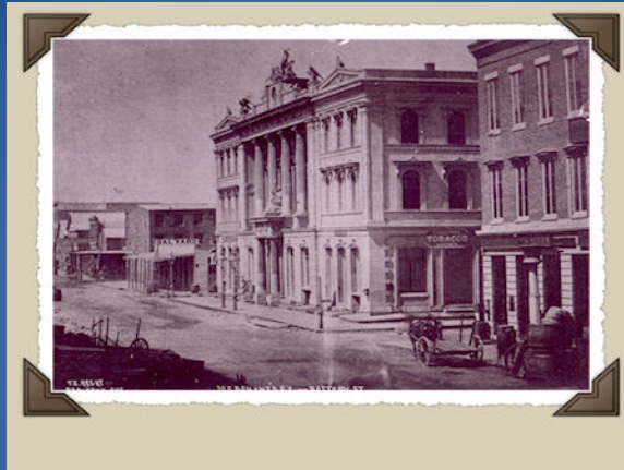
MERCHANT'S EXCHANGE BUILDING, BATTERY & WASHINGTON - 1857