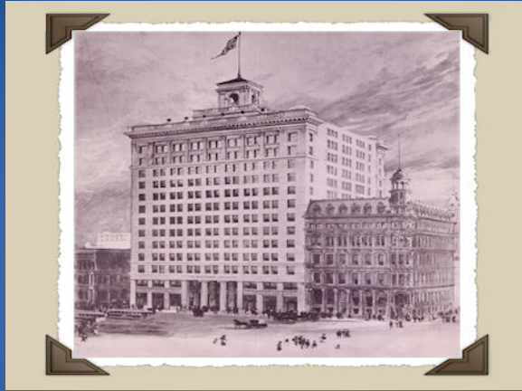
MERCHANT'S EXCHANGE BUILDING 465 CALIFORNIA ST. - 1903