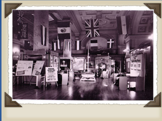
INTERIOR: 465 CALIFORNIA STREET - 1946